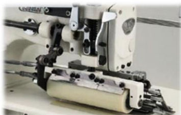
Fabric and thread anti-winding guard.