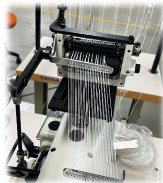
MD2 : Equipped with a metering device, the rubber threads are beautifully finished.