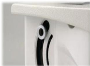
Lever type adjustment Enables to make partial shirring.