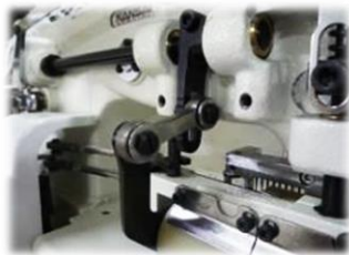
Can easily adjust the puller feed from outside