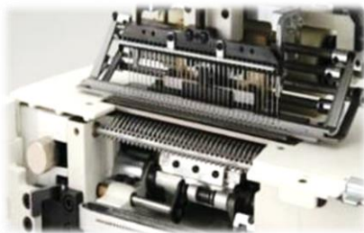
4 spreaders for the decorative thread increase the number of design patterns.