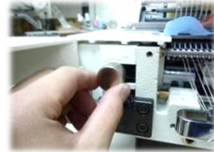
Dial feeding adjustment