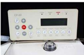
■ Touch panel